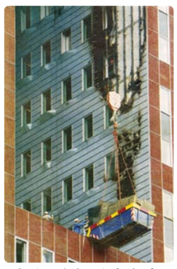
Details are important! Unless warnings from the roofing constructor they choose the cheaper detail. Result; the wooden substructure caught fire.