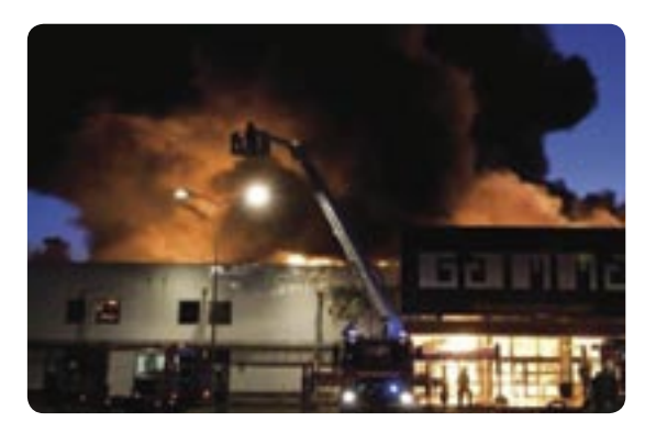
Insulation material type is not the most important factor, e.g. 2008 fire at a Gamma DIY store (NL) with non-combustible insulation.

A high percentage of fires is caused by arson, so not only smoke alarms and sprinklers but also burglar alarms, fencing and entrance protection systems need to be considered.