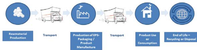
Table: Lifecycle of EPS packaging material

A presentation of quantified environmental life cycle product information for expanded polystyrene (EPS) packaging systems.